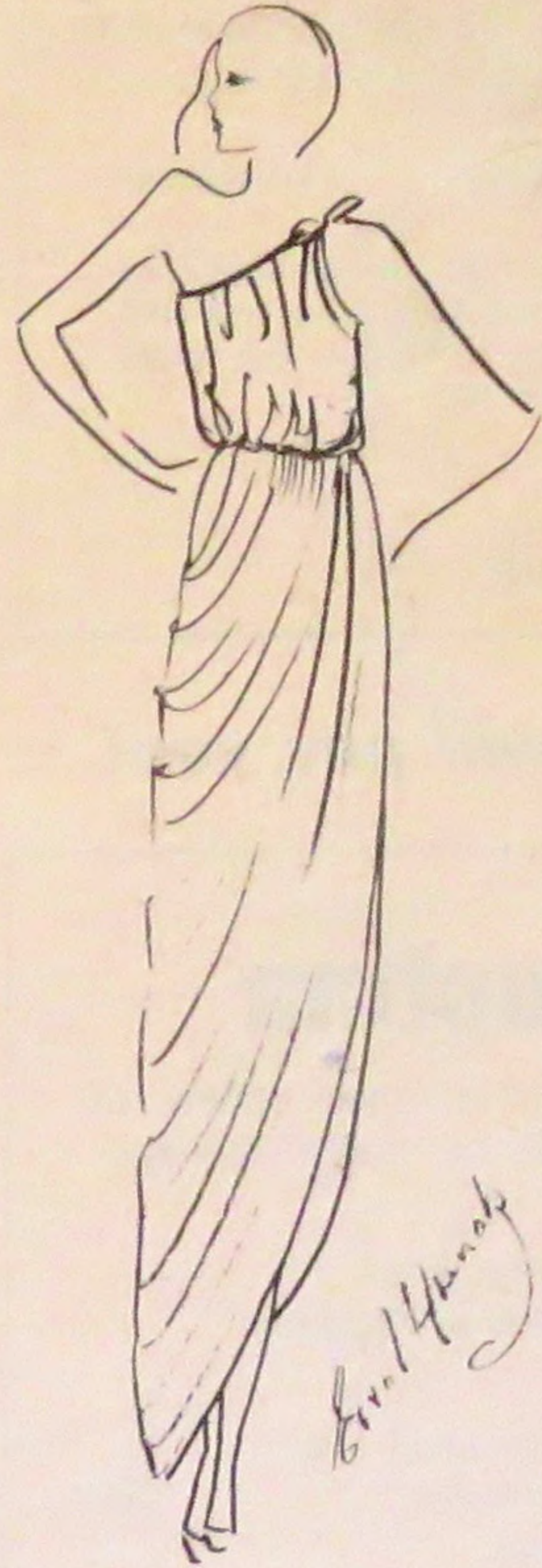
PHAEDRA — a fine jersey-knit toga top with draped skirt.

The accompanying sketches of elegant and unusual dresses form part of the Arendz collection and will be modelled in Windhoek on the 30th.