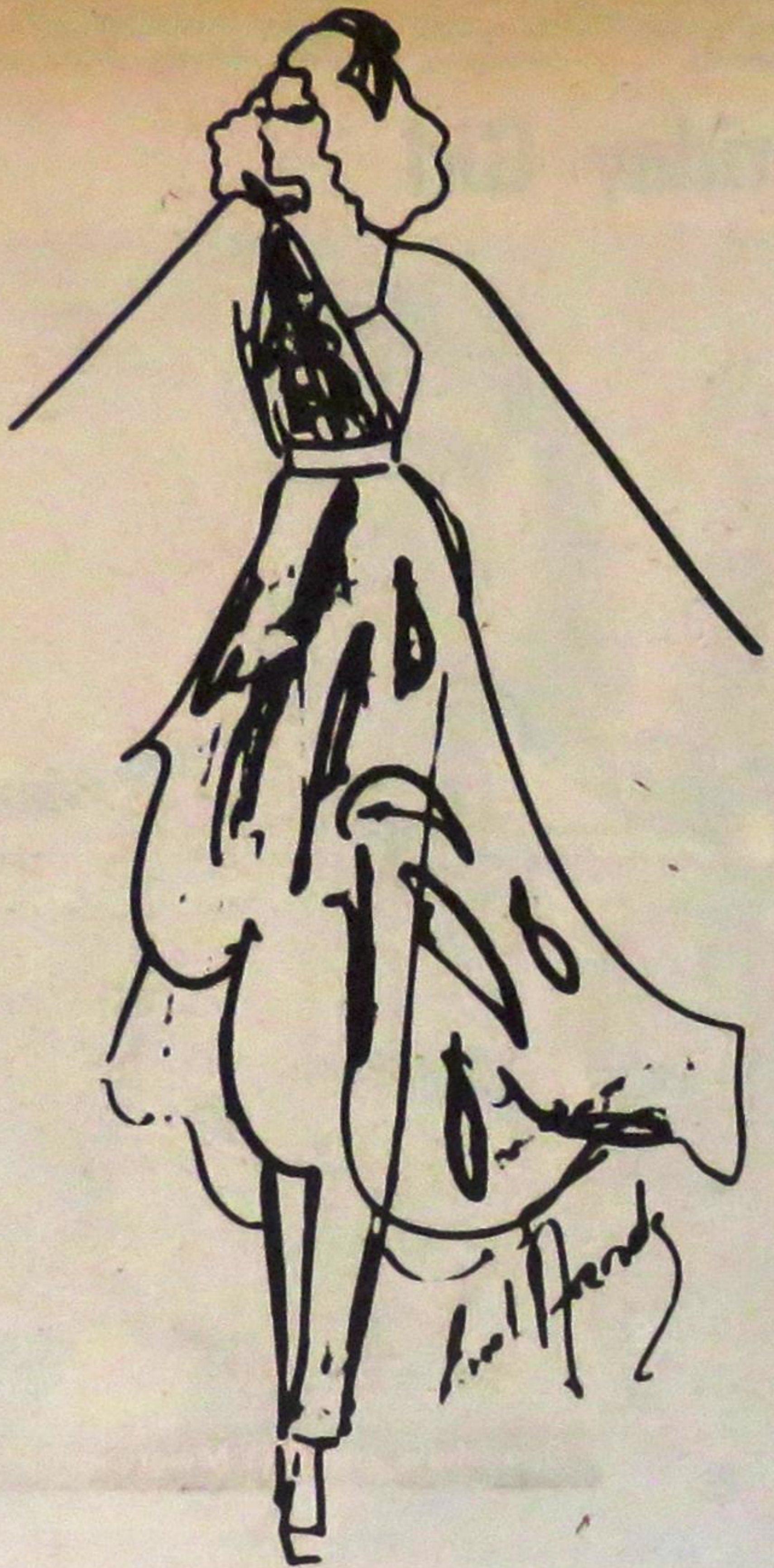
CAMISOLE top and pants in faille with floral chiffon toga nipped in the waist

All in all the show promises to be a very exciting event and the highlight of South West's fashion calendar.