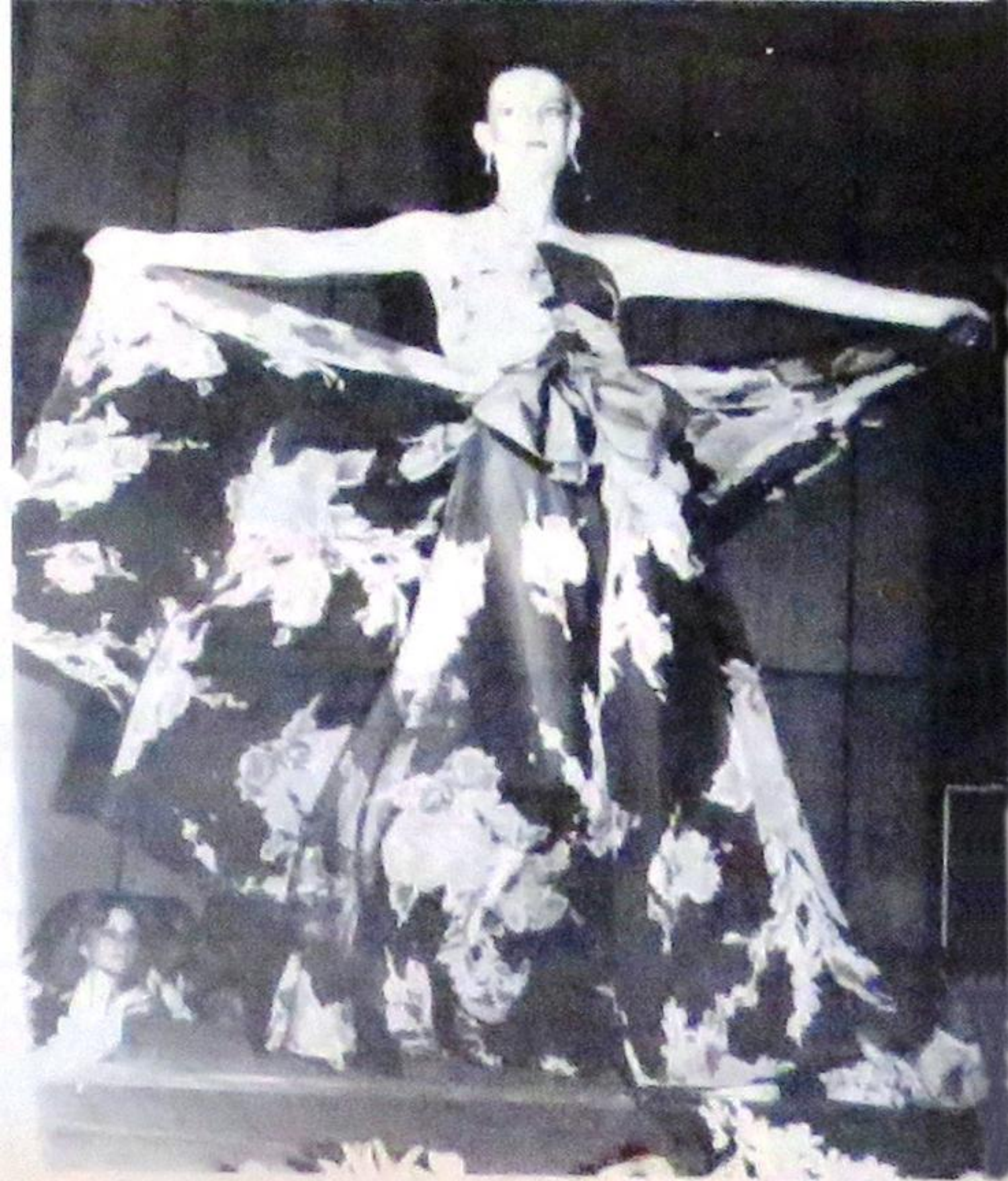
Floating chiffon and a pussy cat bow placed dead-centre.